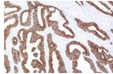
Formalin-fixed, paraffin-embedded Colon stained with Cytokeratin 18 Antibody (IHC018)

Note: This information is only intended as a guide. The optimal dilutions must be determined by the user.