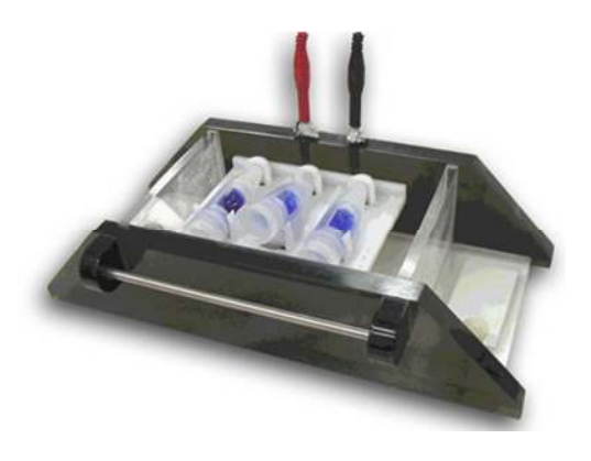
Figure 3: Supporting tray containing three DiaEasy™ Dialyzer tubes in a horizontal electrophoresis tank. The arrow on the cap is positioned face up and the two membranes of the DiaEasy™ Dialyzer tubes are in perpendicular to the electric field.

VIII. Sample concentration by evaporation with DiaEasy<sup>™</sup> Dialyzer tubes: DiaEasy<sup>™</sup> Dialyzer tubes are ideally suited for sample concentration via evaporation because of their dual membranes and large surface area. Dialysis and concentration in the same device reduces protein loss. Unlike closed-system centrifuge-type devices, sample concentration can be easily monitored in the DiaEasy<sup>™</sup> Dialysis tubes.