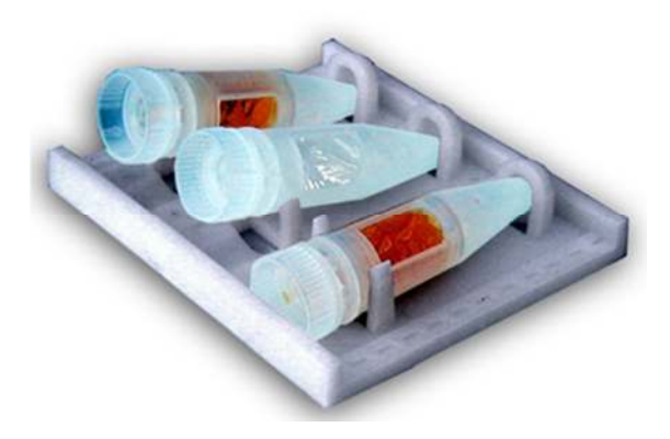
Figure 2: Insertion of the DiaEasy<sup>TM</sup> Dialyzer tubes in the provided supporting tray. The arrow on the cap is positioned face-up.

If sample volume has increased during dialysis, let your sample evaporate on the bench top (a fan increasing airflow across the membrane will speed up the process), check every 10 min or less to prevent full evaporation and dryness.