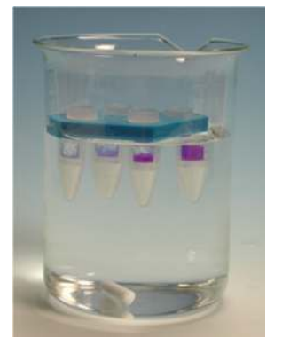
Figure 1: Dialysis with DiaEasy™ dialyzer tubes