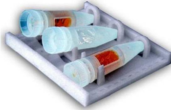
Figure 2: Insertion of the DiaEasy™ Dialyzer tubes in the provided supporting tray. The arrow on the cap is positioned face-up.