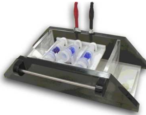
Figure 3: Supporting tray containing three DiaEasy™ Dialyzer tubes in a horizontal electrophoresis tank. The arrow on the cap is positioned face up and the two membranes of the DiaEasy™ Dialyzer tubes are in perpendicular to the electric field.

VIII. Sample concentration by evaporation with DiaEasy™ Dialyzer tubes: DiaEasy™ Dialyzer tubes are ideally suited for sample concentration via evaporation because of their dual membranes and large surface area. Dialysis and concentration in the same device reduces protein loss. Unlike closed-system centrifuge-type devices, sample concentration can be easily monitored in the DiaEasy™ Dialysis tubes.