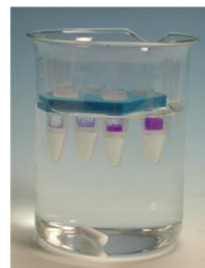
Figure 1: Dialysis with DiaEasy™ dialyzer tubes