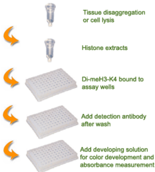
Schematic Procedure for Using the EpiQuik™ Global Di-Methyl Histone H3-K4 Quantification Kit (Colorimetric)

intensity of absorbance. The absolute amount of di-methylated H3-K4 can be quantified by comparing to the standard control.