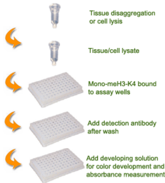
Schematic Procedure for Using the EpiQuik™ Global Mono-Methyl Histone H3-K4 Quantification Kit (Colorimetric)