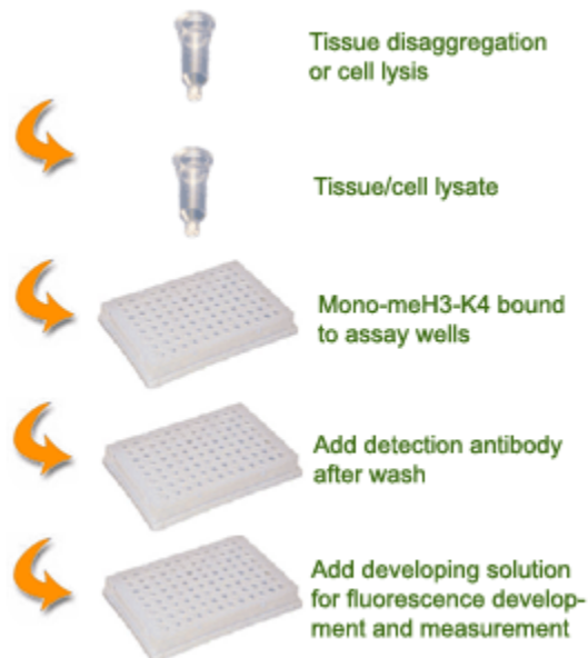
Schematic Procedure for Using the EpiQuik ™ Global MonoMethyl Histone H3-K4 Quantification Kit (Fluorometric)

labeled detection antibody followed by a fluorescent development reagent. The ratio of mono-methylated H3-K4 is proportional to the intensity of fluorescence. The absolute amount of mono-methylated H3-K4 can be quantitated by comparing to the standard control.