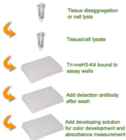
Schematic Procedure for Using the EpiQuik™ Global Tri-Methyl Histone H3-K4 Quantification Kit (Colorimetric)

captured tri-methylated histone H3-K4 can then be detected with a labeled detection antibody, followed by a color development reagent. The ratio of tri-methylated H3-K4 is proportional to the intensity of absorbance. The absolute amount of tri-methylated H3-K4 can be quantitated by comparing to the standard control