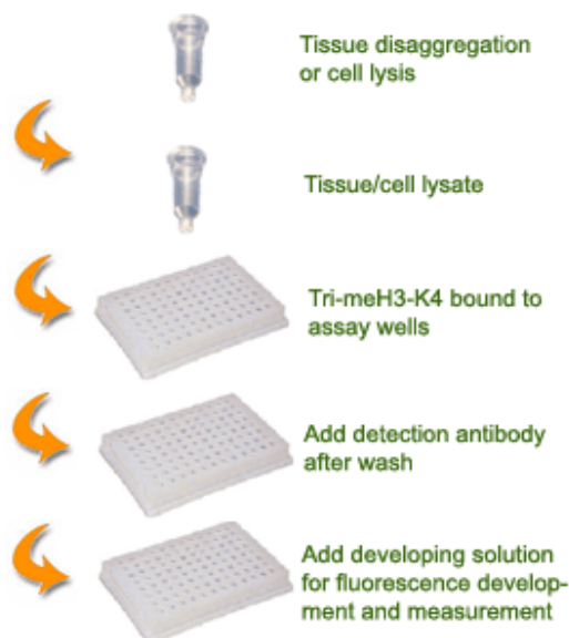
Schematic Procedure for Using the EpiQuik™ Global Tri-Methyl Histone H3-K4 Quantification Kit (Fluorometric)

H3 at lysine 4 is captured to the strip wells coated with an anti-trimethyl H3-K4 antibody. The captured tri-methylated histone H3-K4 can then be detected with a labeled detection antibody, followed by a fluorescent development reagent. The ratio of tri-methylated H3-K4 is proportional to the intensity of fluorescence. The absolute amount of tri-methylated H3-K4 can be quantitated by comparing to the standard control.