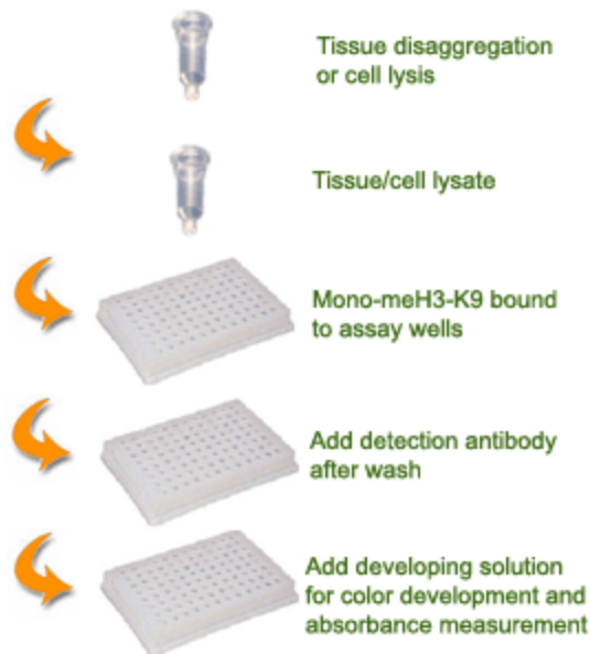
Schematic Procedure for Using the EpiQuik™ Global Mono-Methyl Histone H3-K9 Quantification Kit (Colorimetric)