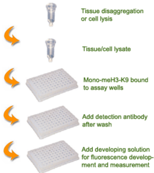
Schematic Procedure for Using the EpiQuik™ Global Mono-Methyl Histone H3-K9 Quantification Kit (Fluorometric)

labeled detection antibody, followed by a fluorescent development reagent. The ratio of mono-methylated H3-K9 is proportional to the intensity of fluorescence. The absolute amount of mono-methylated H3-K9 can be quantitated by comparing to the standard control.