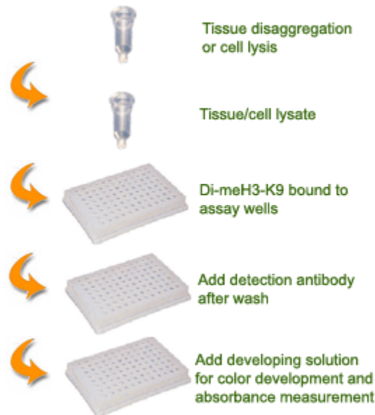
Schematic Procedure for Using the EpiQuik™ Global Di-Methyl Histone H3-K9 Quantification Kit (Colorimetric)

intensity of absorbance. The absolute amount of di-methylated H3-K9 can be quantitated by comparing to the standard control.