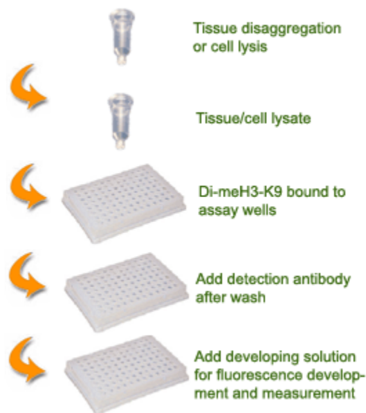
Schematic Procedure for Using the EpiQuik ™ Global Di-Methyl Histone H3-K9 Quantification Kit (Fluorometric)

The EpiQuik ™ Global Di-Methyl Histone H3-K9 Quantification Kit (Fluorometric) is designed for measuring global histone H3-K9 di-methylation. In an assay with this kit, the di-methylated histone H3 at lysine 9 is captured to the strip wells coated with an anti-di-methyl H3-K9 antibody. The captured di-methylated histone H3-K9 can then be detected with a labeled detection antibody, followed by a fluorescent development reagent. The ratio of di-methylated H3-K9 is proportional to the intensity of fluorescence. The absolute amount of di-methylated H3-K9 can be quantitated by comparing to the standard control.