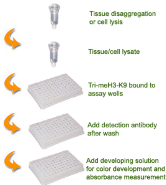
Schematic Procedure for Using the EpiQuik™ Global Tri-Methyl Histone H3-K9 Quantification Kit (Colorimetric)